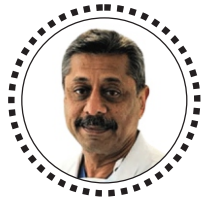
Dr. Naresh Trehan Chief Patron